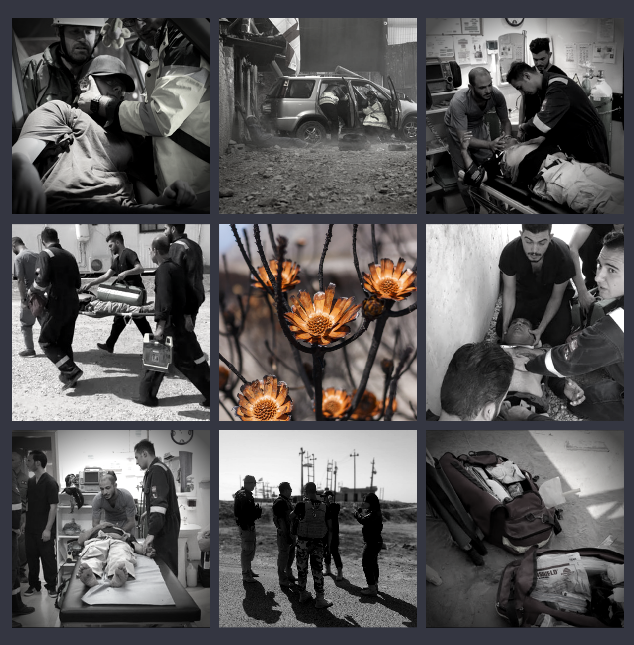
Responding - Adapting - Evolving