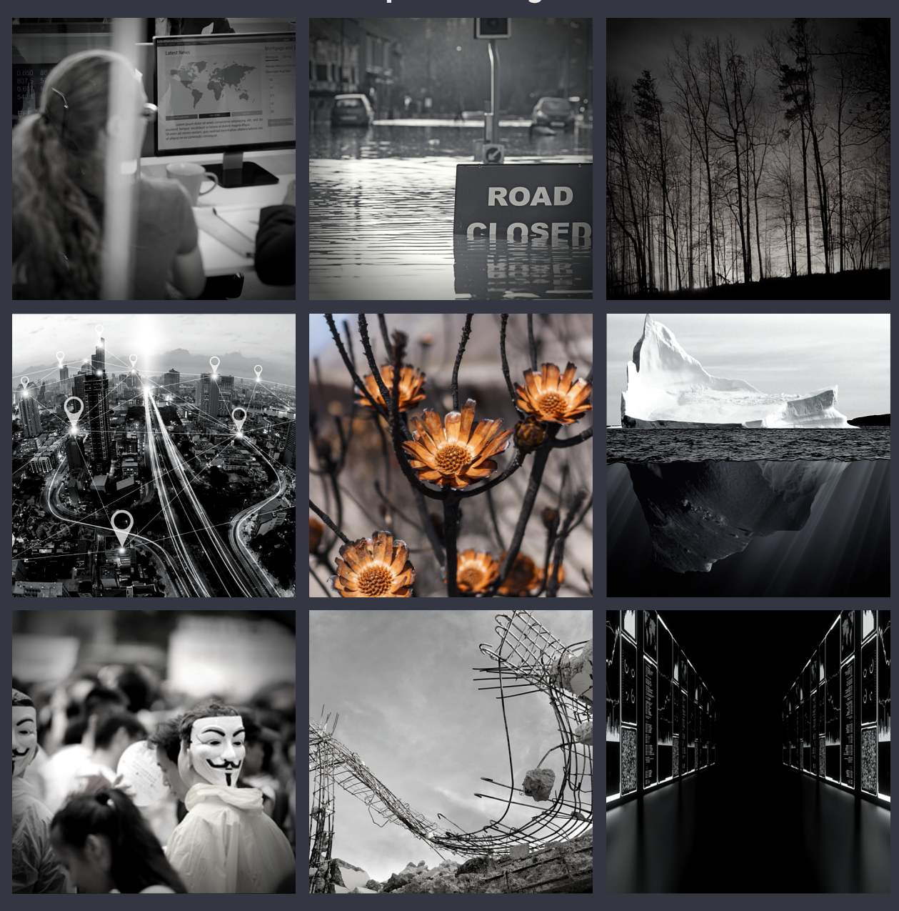
Responding - Adapting - Evolving